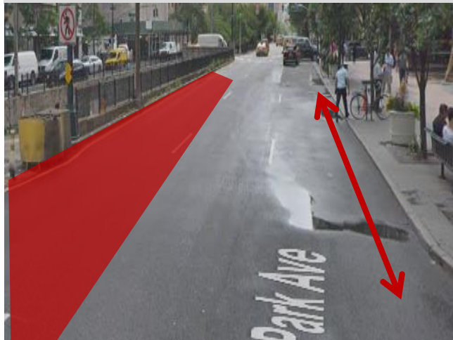
Park Avenue Southbound between E. 39 th and E. 40 th streets

The NYCDOT Division of Bridges will begin the work to install new precast concrete walls along the north portal at the Park Avenue Tunnel. This work is part of the ongoing rehabilitation project and will continue until approximately March 31st. Temporary lane closures will continue on Park Avenue Northbound and Southbound between E. 39 th Street and E. 40 th Street. The right parking lane will remain a travel lane for the duration of this phase of the work. Two lanes of traffic will be maintained at all times on Park Avenue