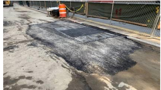
Newly installed electrical service box on E. 25 th St. bt Lexington Ave. and 3 rd Ave.

The New York City Department of Design and Construction (NYCDDC) is managing the reconstruction of a permanent plaza along E. 25th Street between Lexington Avenue and 3 rd Avenue on behalf of the Department of Transportation and in partnership with Baruch College.