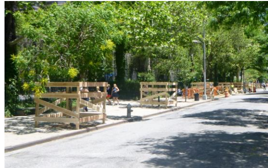
Tree Guards Installed at various locations within the project

Pack your trash properly to avoid breakage and/or spill over. Place it in the designated areas as close to collection time as possible. If you use a private carter, ensure your trash collection occurs in a timely fashion. If unsure where to bring your trash, please call the CCL.