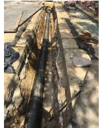
Installation of New 12" Water Main